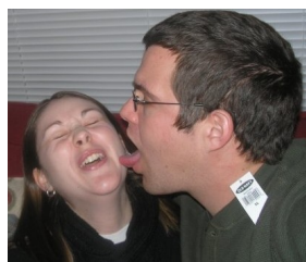
I think she likes it!